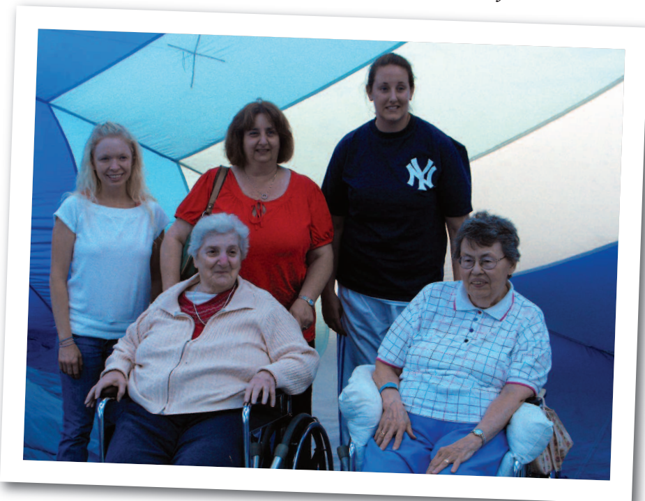
Below: Residents of Lutheran Care Center at Concord Village and their families attend the annual local balloon festival.