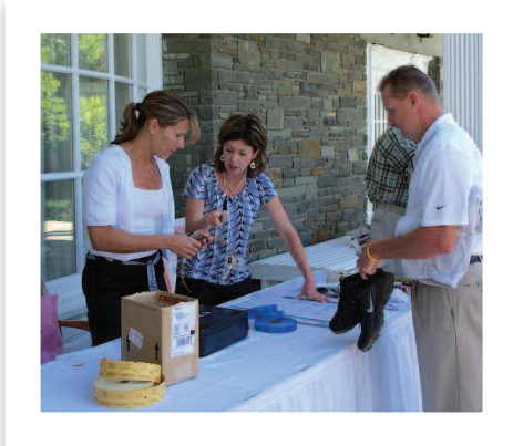
The Lutheran Care Network is always a busy place. Activities this summer and fall included an inaugural Golf Outing at the Albany Golf Club, and Farm Fest at Coburg Village, an autumn festival for residents and friends.